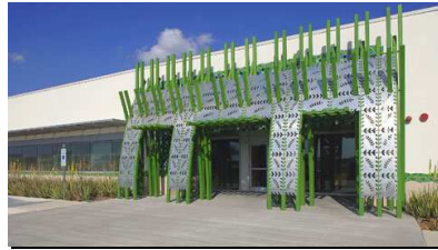
TAMHSC Campus in McAllen

Master of Public Health in Health Policy & Management | www.srph.tamhsc.edu/mcallen